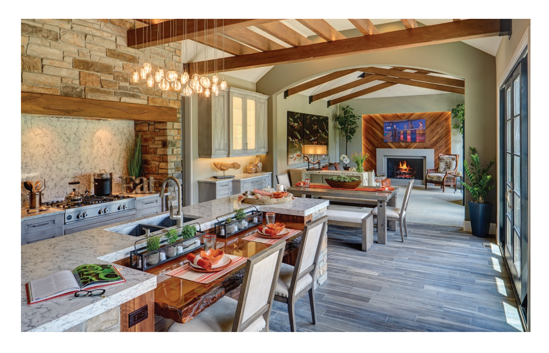
Moceri Homes award-winning entry for Interior Use of Tile at the 2015 11th Annual Design Awards