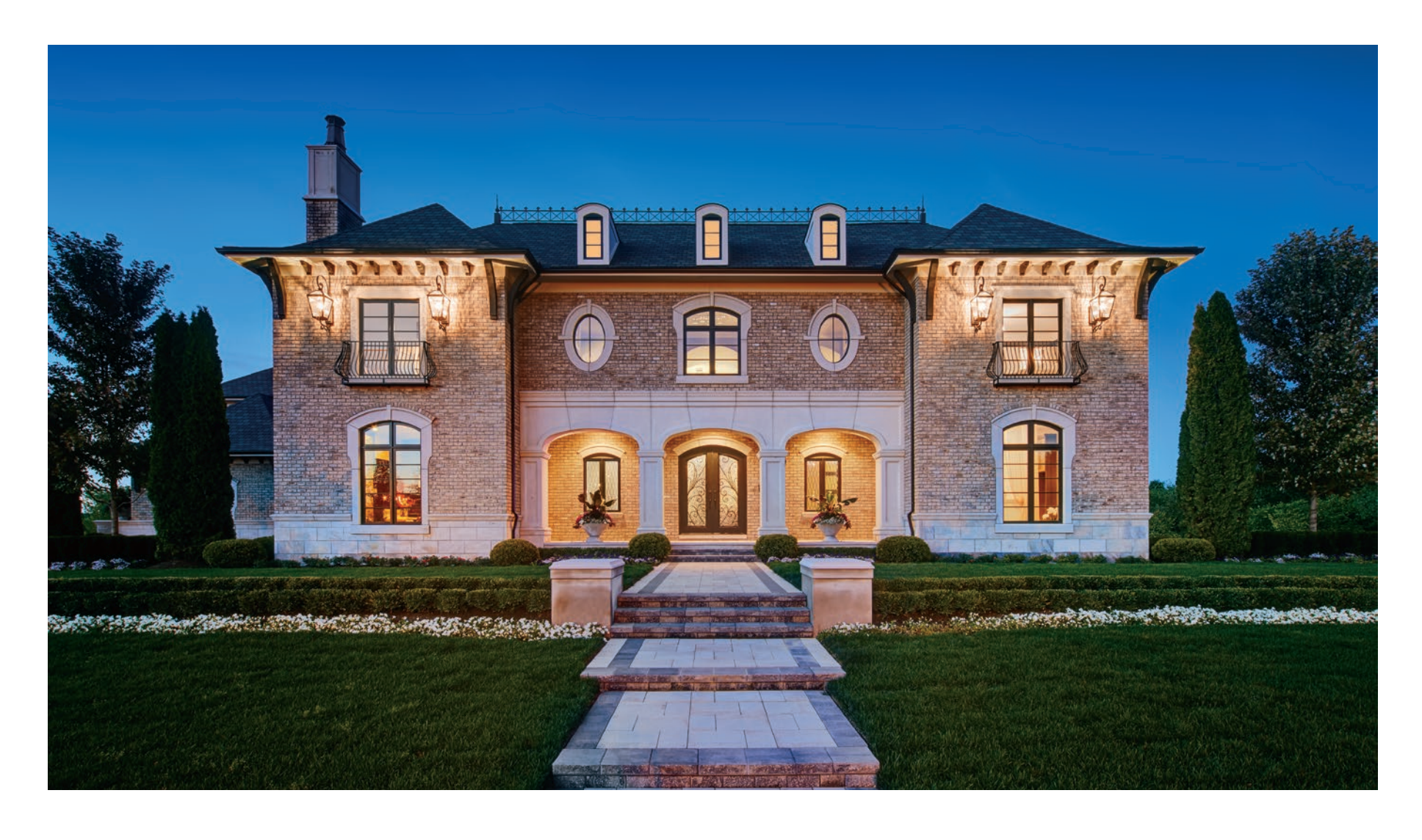
Moceri Homes award-winning entry for Interior/Exterior Lighting at the 2015 11th Annual Design Awards