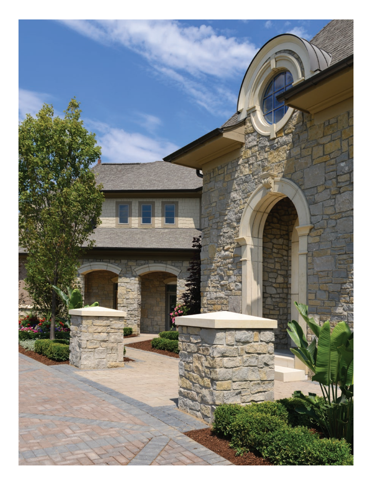
Moceri Homes award-winning entry for Exterior Use of Stone at the 2015 11th Annual Design Awards